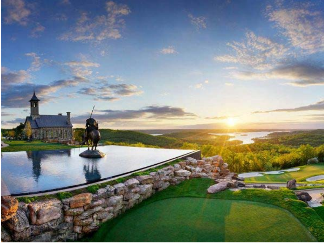
Big Cedar Lodge