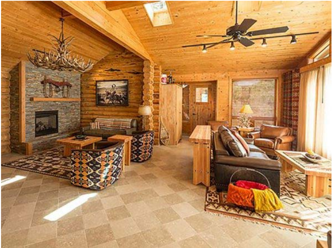
Silvies Valley Ranch