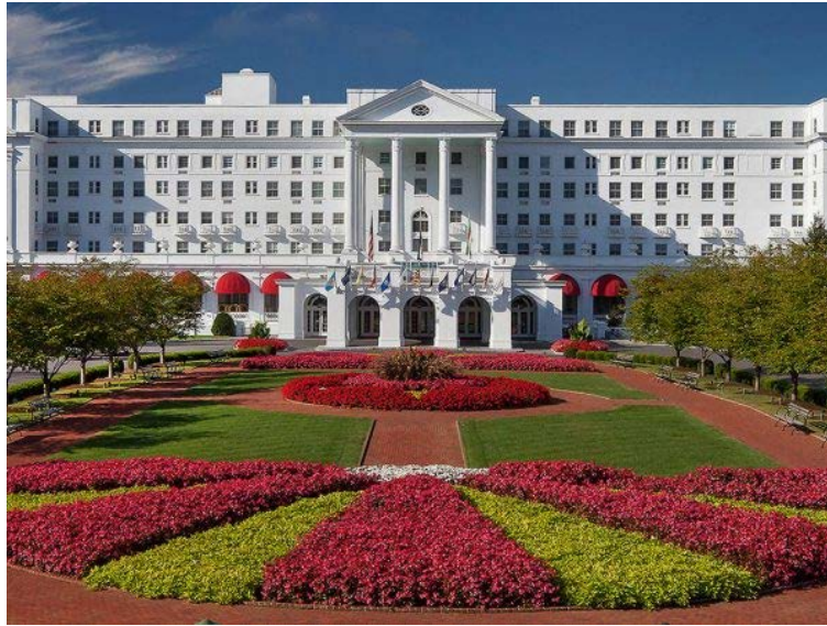
The Greenbrier Hotel and Resort

Resurrected from the scrap heap by billionaire and current Governor of West Virginia Jim Justice, The Greenbrier has become one of the most popular destinations on the PGA Tour calendar among the players that attend. The hotel has been beautifully restored, and the sprawling mansion-style structure is an attraction in itself. Great restaurant options at the Greenbrier include a steakhouse named after NBA legend Jerry West, and if you're lucky, you'll see him there. The TPC Old White Course is the best known of the four courses available to the public, but The Meadows is the local favorite and more picturesque. That thing I mentioned about cheaper fall golf does not apply here; the courses are kind of pricey in October. But you can make it up at the on-property casino that is reserved for guests only, and therefore 80 percent less skeezy than most casinos.