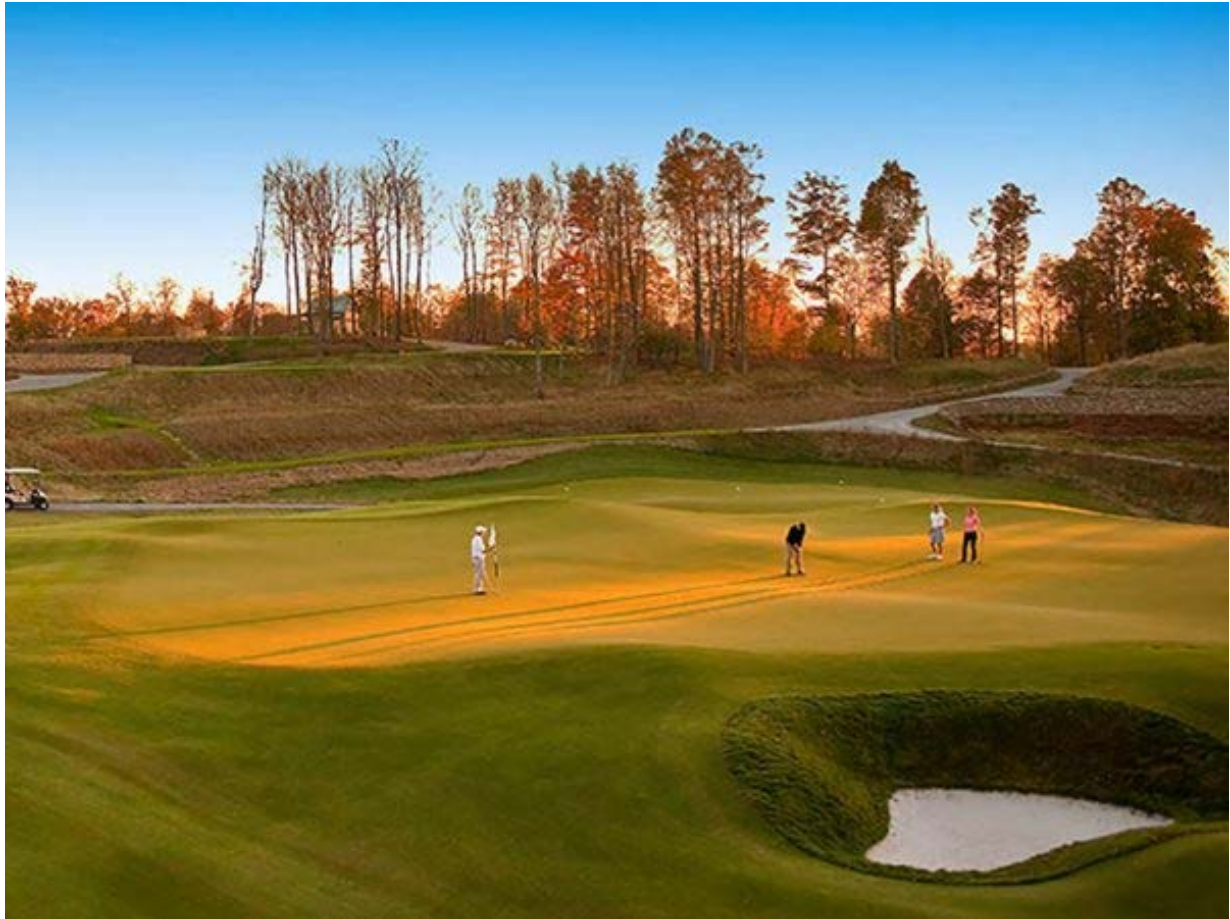
Primland Highland course