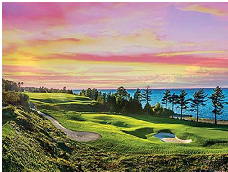
Bay Harbor Club