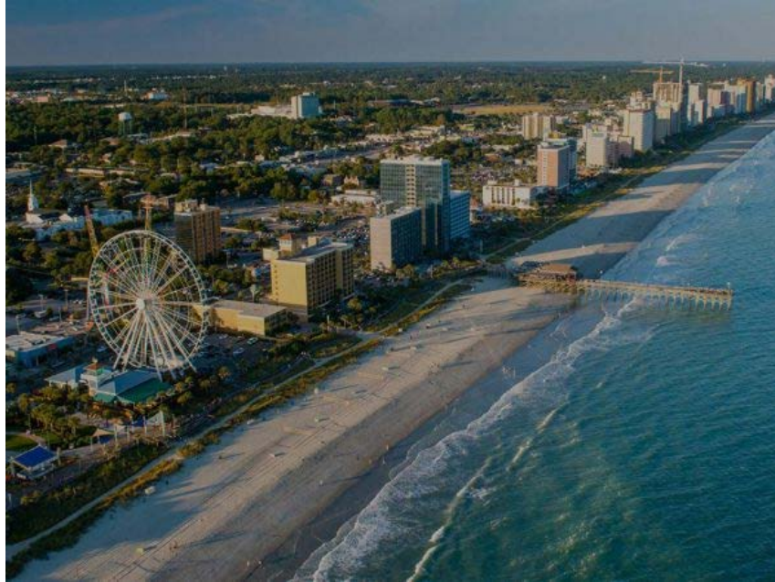
Myrtle Beach Grand Strand

I know; saying that you should visit Myrtle Beach is like saying you should listen to some jazz; there's a lot of it and it's all very different. That said, autumn is kind of the perfect time to visit Myrtle. It's after Labor Day so the crowds are gone. Rooms and tee times are easier to get and for better prices. Not to mention that the summer heat is replaced by some cool ocean breezes. There are literally dozens of golf courses to choose from, too many to mention here, so I'll just recommend that if you haven't had a chance to play Caledonia and True Blue, make it a priority. The courses are the work of Mike Stranz, a genius who died young and left a small but stunning body of work that begs the question, "What if?". Off the course, you can find restaurants up and down the Strand that range from gourmet to Krispy Kreme. Challenge yourself to find a bar that no one had heard of.