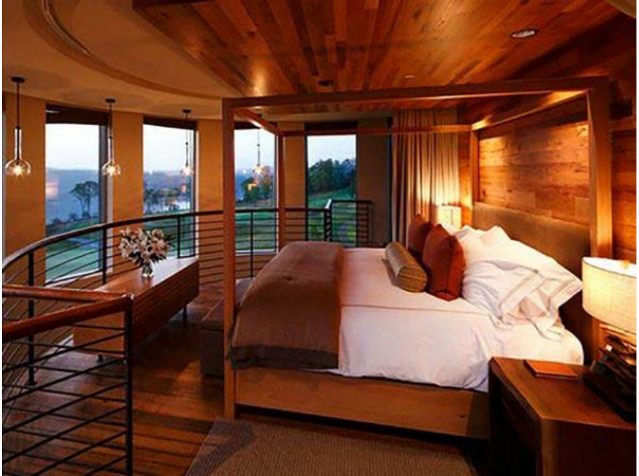
Observatory suite at Primland

One of the best things about Primland is that it's under the radar. Ok, close your eyes imagine that a James Bond villain decided to build a kick-ass golf resort complete with a missile silo disguised to look like...a silo? That's Primland. Tucked in the Blue Ridge mountains just over the North Carolina border, Primland is truly next level in every category that you could rate a modern resort. The rooms are the apex of comfort and high tech, a little bit country and a little bit rock and roll. Jay Hass and Fred Couples are staff pros and they spend a lot of time there so keep a sharpie and cell phone handy for an autograph and a selfie.