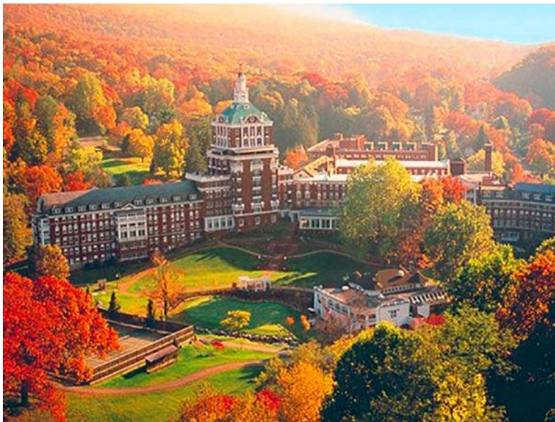
The Omni Homestead