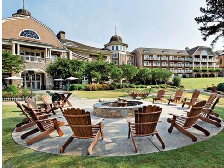
Ritz-Carlton at RLO

Built on the shores of a massive man-made lake halfway between Atlanta and Augusta in Georgia, Reynolds Lake Oconee is blessed with a beautiful natural setting where almost anything would be a pleasure. Fortunately, golf has been a big part of the plan from the start at RLO. The resort offers comfortable cabins and houses for rent but live a little and stay at the Ritz-Carlton hotel on the property. Before you go out to play, stop by the Reynolds Kingdom of Golf presented by TaylorMade, an equipment and practice mecca where you could find guys like Justin Rose or Jason Day tweaking their driver or working on their swing in the bay next to you.