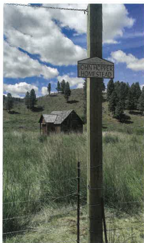
The clubhouse (above) includes a pro shop, bar, restaurant and open patio with panoramic views. Tours of John Hopper’s homestead (below) reflect the simple life of long ago.

At check-in, guests saddle up in their own golf carts for transport around the ranch during their stay. Special lithium batteries and heightened suspension