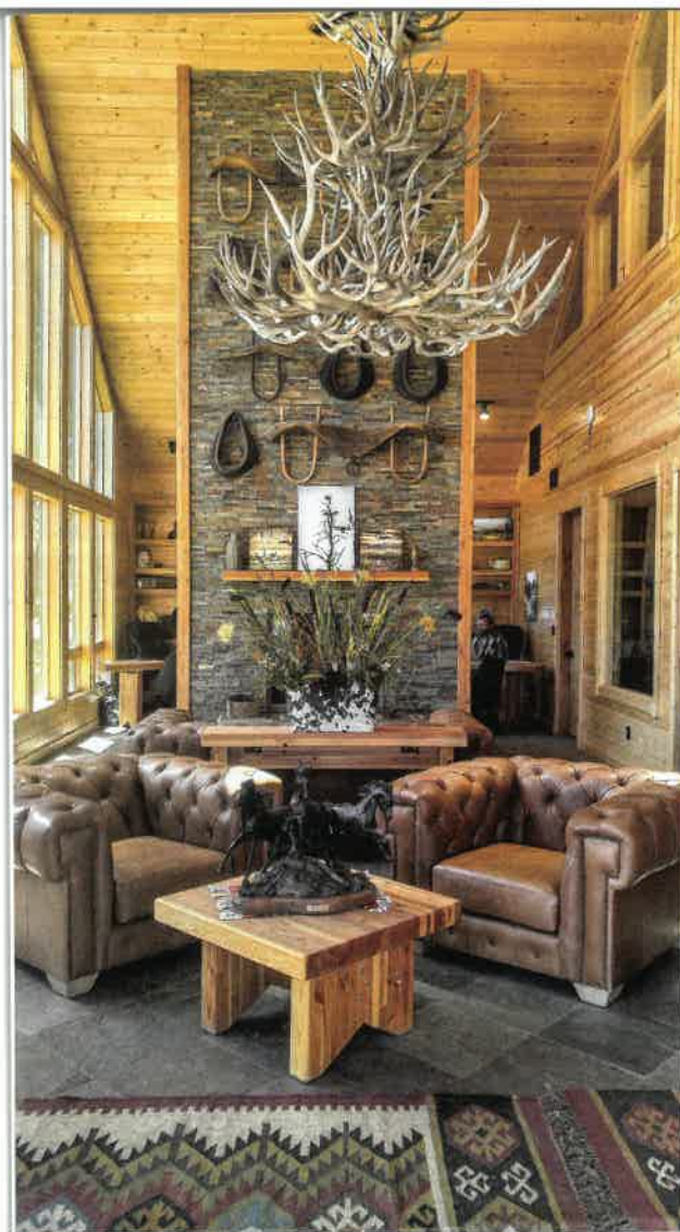
Western motif welcomes guests in the lobby (left) and throughout the ranch. A lake (right) and executive course is named after Chief Egan, the last war chief of the Paiute tribe. Goat caddies (bottom,) work for peanuts.