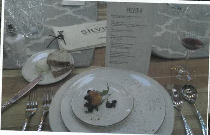
Clockwise from top left: A clubhouse patio table overlooks the Chief Egan course; aerial view of the ranch; elegant table setting at the Chef’s seven-course dinner in the lodge; the antique spreader; a curious herd of American Range goats; the practice green in front of the course’s opening hole.